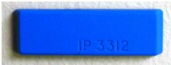
Small Linear Tag – 45 x 15 x 4 mm, suitable for mounting on thin metal surfaces